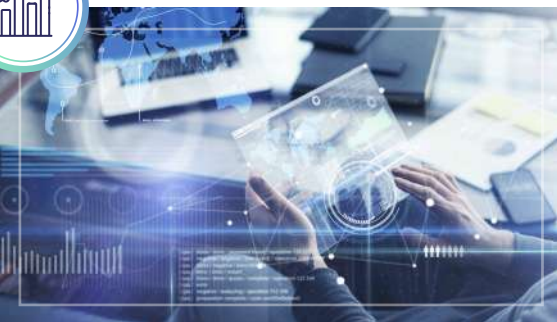
Public Services Portal & Mobile Government