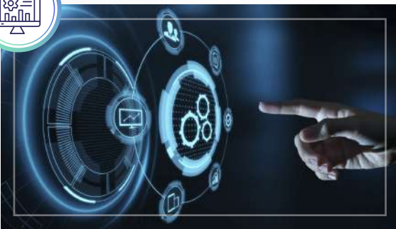
Business Process Reengineering