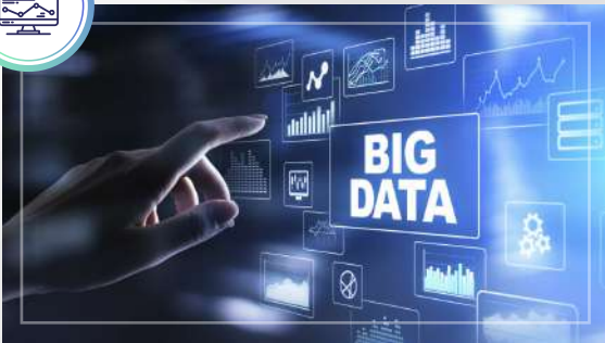
Business & Big Data Analytics