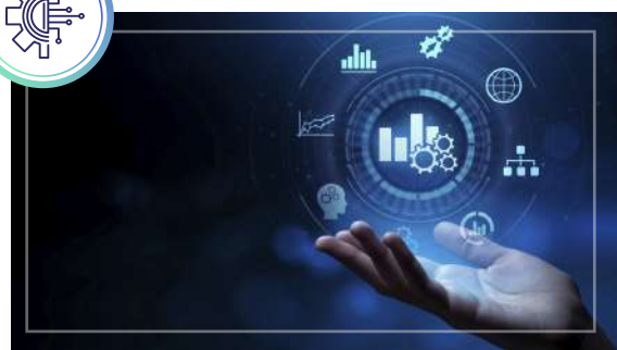
Robotic Process Automation & Business Intelligence